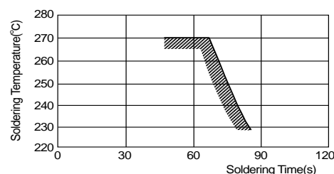
[Allowable Reflow Soldering Temperature and Time]

In the case of repeated soldering, the accumulated soldering time must be within the range shown above.