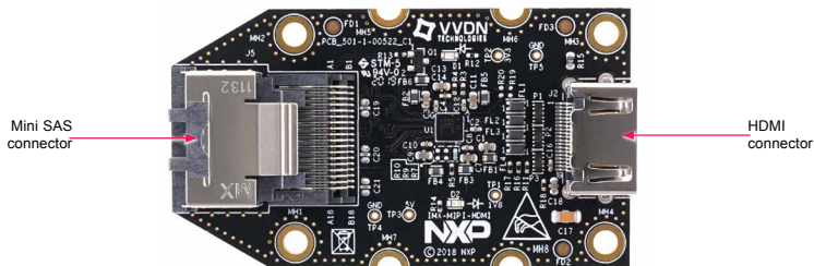
Figure 3: MIPI-DSI to HDMI Adaptor Card (included in the EVK) Note: (Color of the adaptor card may differ)