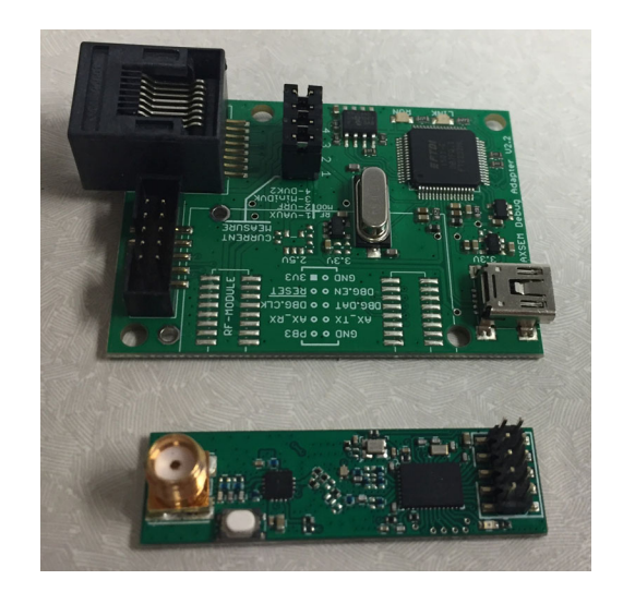
Figure 1. DVK Boards