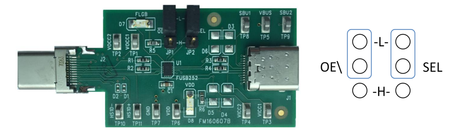
Figure 1 – Board Top View and DP/DM Select Pin Map

After performing OVP testing, the Type-C receptacle can accept a Type-C device such as a memory stick to demonstrate normal USB functionality (with SEL=L).