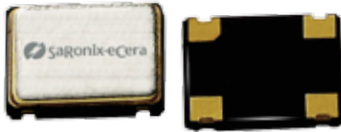
7.0 x 5.0mm Ceramic SMD