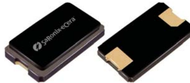
8.0 x 4.5mm Ceramic SMD