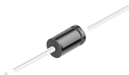
DO-35 Glass case COLOR BAND DENOTES CATHODE