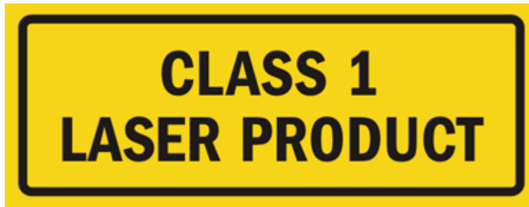
Figure 1. Class 1 laser product label

The VL53L5 contains a laser emitter and the corresponding drive circuitry. The laser output is designed to remain within Class 1 laser safety limits under all reasonably foreseeable conditions including single faults in compliance with IEC 60825-1:2014 (third edition). The laser output remains within Class 1 limits as long as the STMicroelectronics recommended device settings are used and the operating conditions specified in the STM32U5 datasheets are respected. The laser output power must not be increased by any means and no optics used to focus the laser beam. Figure 1 shows the warning label for Class 1 laser products.