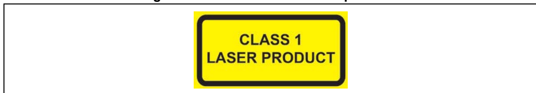
Figure 1. Label for Class 1 laser products

The VL53L0X contains a laser emitter and corresponding drive circuitry. The laser output is designed to remain within Class 1 laser safety limits under all reasonably foreseeable conditions including single faults, in compliance with IEC 60825-1:2014 (third edition). The laser output will remain within Class 1 limits as long as STMicroelectronics recommended device settings are used and the operating conditions, specified in the STM32L4 Series datasheets, are respected. The laser output power must not be increased by any means and no optics should be used with the intention of focusing the laser beam. Figure 1 shows the warning label for Class 1 laser products.