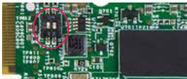
Figure 2. SW602 setting for internal boot mode