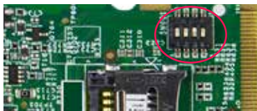
Figure 3. SW601 setting for internal boot mode