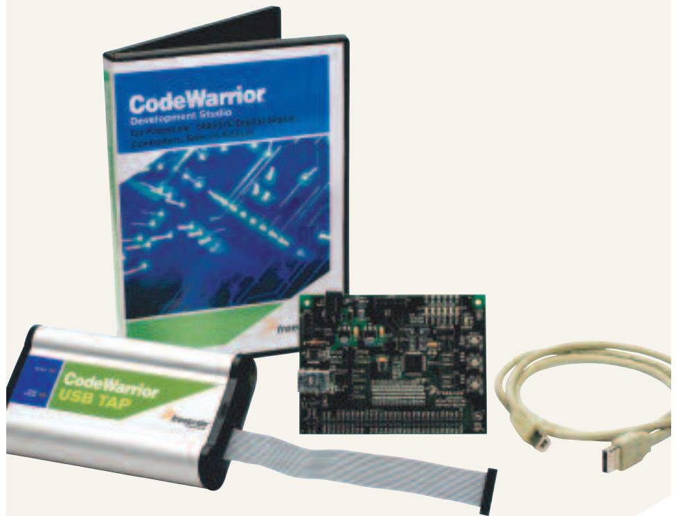
MC56F8037EVM Development Kit

The kits allow designers to develop and evaluate applications for 56F8000 series digital signal controllers. These kits include a development board that uses a 32 MIPS MC56F8013, MC56F8014 or MC56F8037 digital signal controller with an on-chip oscillator. These boards also include an expansion connector for easy interface to 56F8000 daughter cards. For rapid application development, the kits include the award-winning CodeWarrior Development Studio for 56800/E with Processor Expert technology. CodeWarrior tools allow for development, compiling, linking and debugging applications, while the Processor Expert tool provides access to fully debugged peripheral drivers, libraries and example applications. A free CodeWarrior permanent license for development, up to 16 KB code size, on 56F80xx devices can be obtained with simple web-based registration.