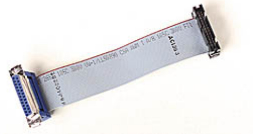
Order Now Model AC1393

The Model AC1393 optional 6-inch flat ribbon adapter cable includes a 25-pin female connector and a 26-pin male header connector. This cable converts any 7B Series backplane 25-pin I/O connector to the 26-pin cable connectors (see Model AC1315).