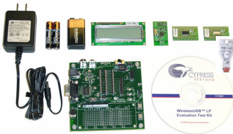
FIGURE 2. WirelessUSB LP EVK contents including platform board, MiniProg, modules, batteries, and adapter