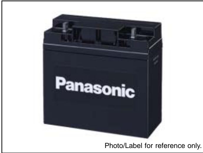
(a) The photo and dimensions represent LC-X1220P.