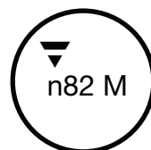
HGZ 330 pF to 2.2 nF